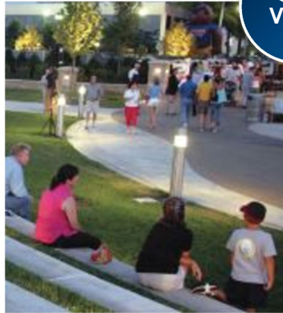
Performance and Gathering Space